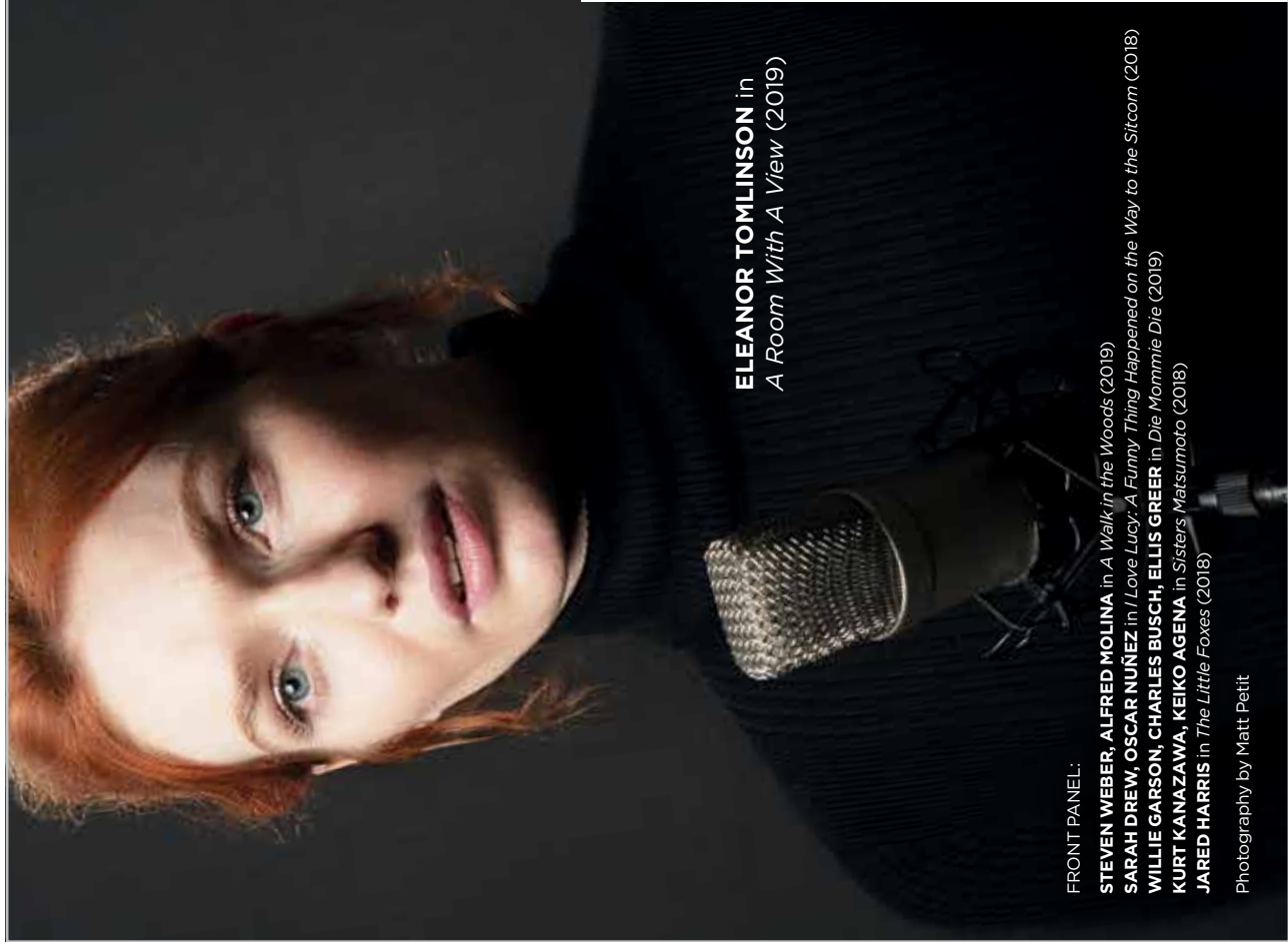
ELEANOR TOMLINSON in A Room With A View (2019)